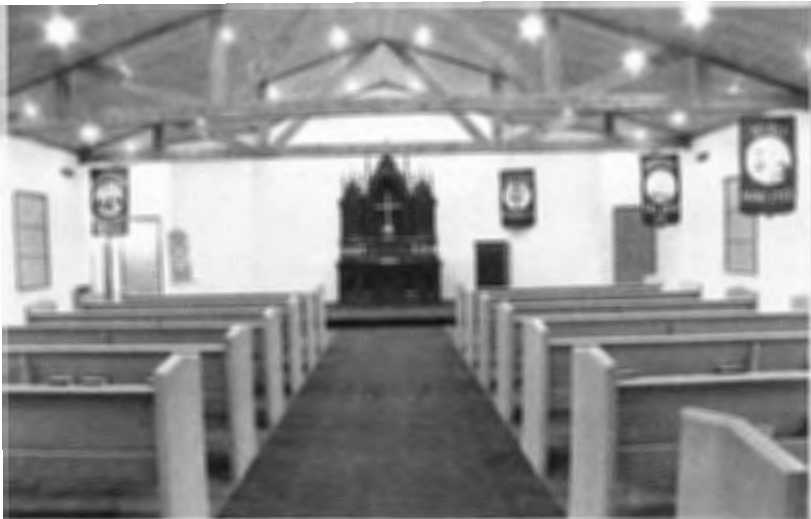
CHRIST (Klamath Falls, Oregon)