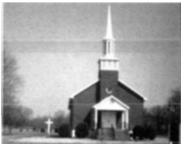
SCRIPTURAL (Cape Girardeau, Missouri)