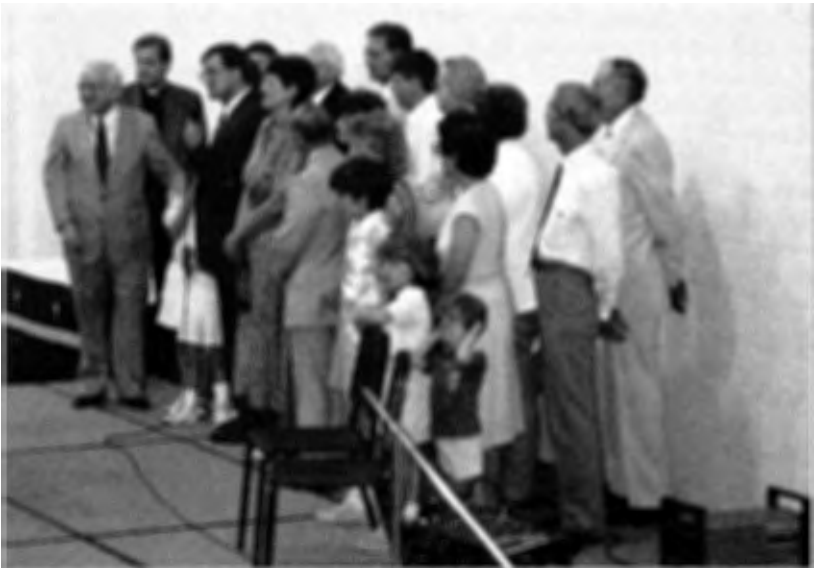
Receiving New Members

After some preliminaries the convention considered the report of its Synodical Membership Committee. Six pastors and two congregations were received into membership in the synod.