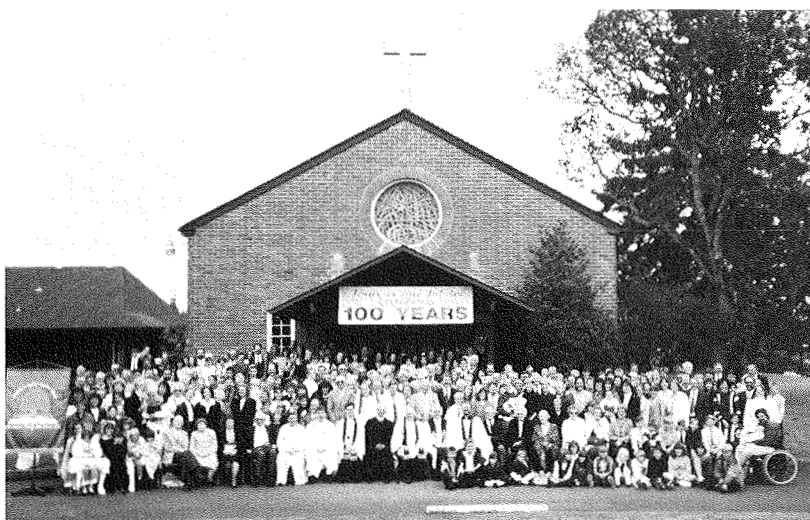
PARKLAND (Tacoma, Washington)