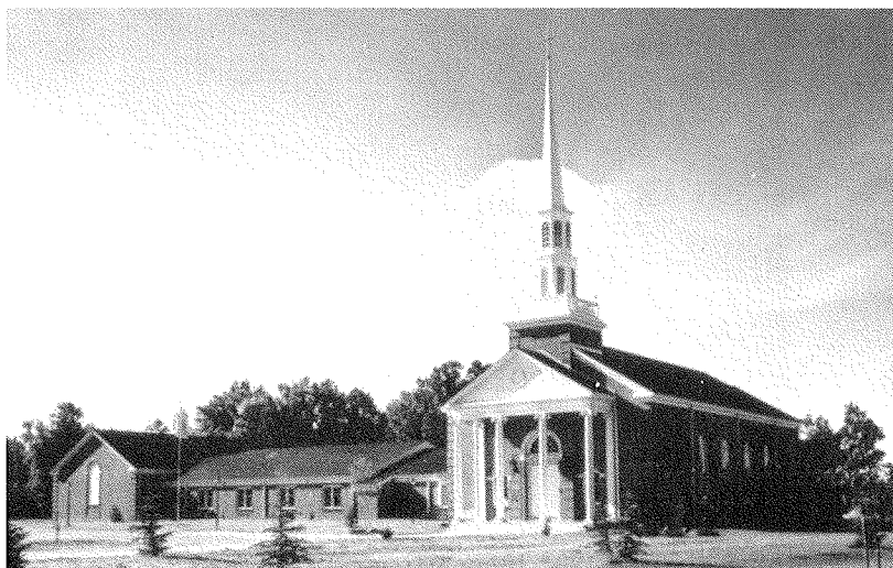
HOLY SCRIPTURE (Midland, Michigan)