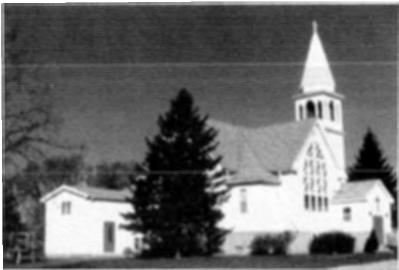
SCARVILLE (Scarville, Iowa)

Concordia Lutheran Church, Eau Claire, Wisconsin celebrated the 20th anniversary of the dedication of its church building on September 12. F. Theiste preached the sermon.