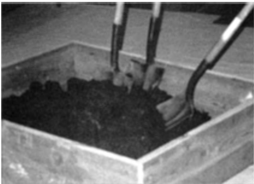
Trinity Chapel Groundbreaking