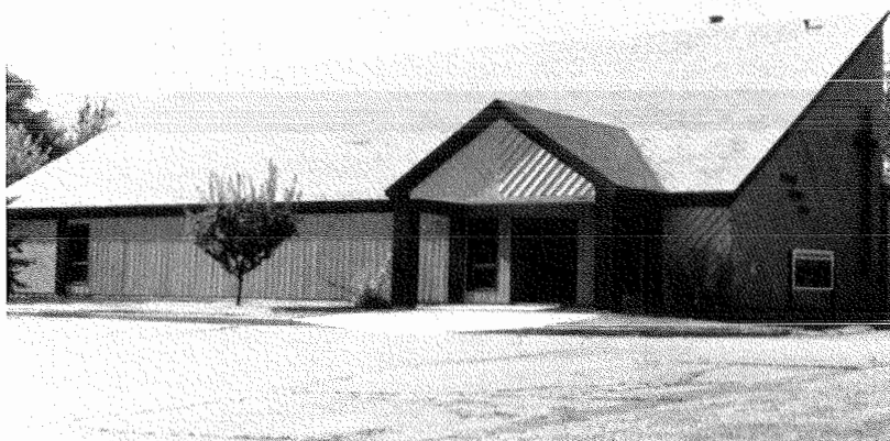
ASCENSION (Eau Claire, Wisconsin)