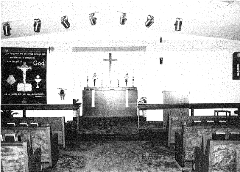
SAVED BY GRACE (Gresham, Oregon)