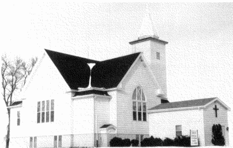
CENTER (Scarville, Iowa)