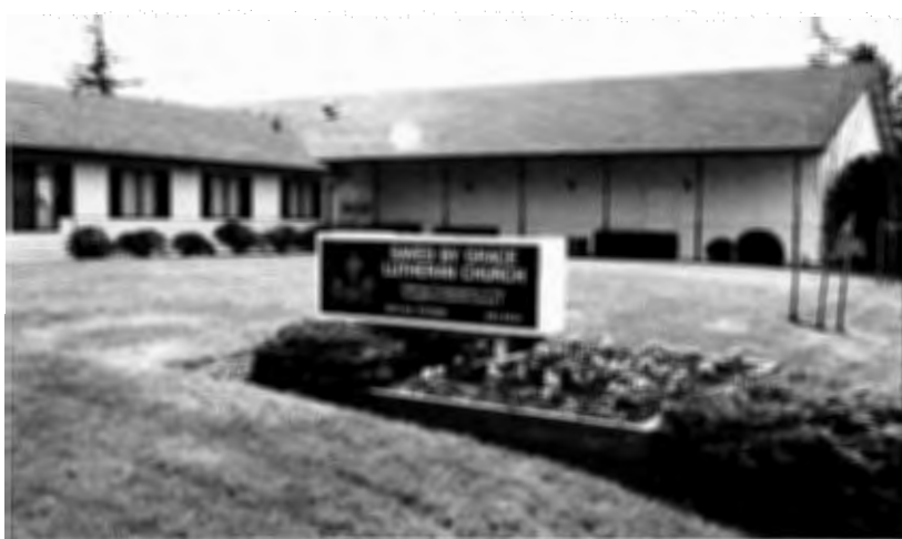
SAVED BY GRACE (Gresham, Oregon)