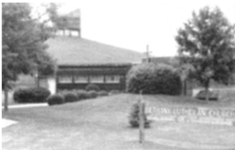
BETHANY (Ames, Iowa)