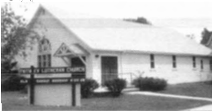
FAITH (Alpena, Michigan)