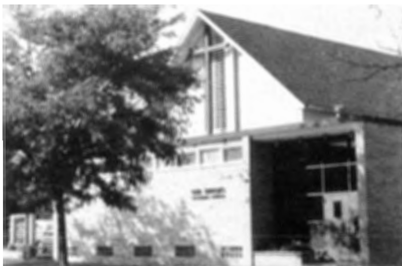
OUR SAVIOR'S (Albert Lea, Minnesota)