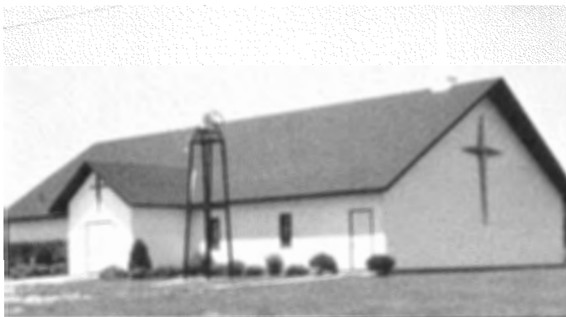
OUR SAVIOR'S (Bagley, Minnesota)