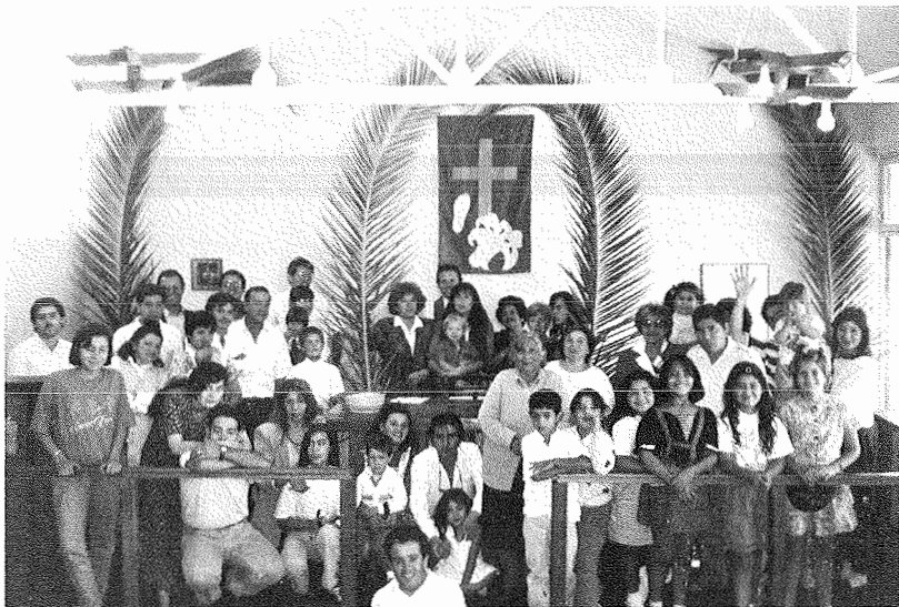
Worship gathering—Santiago, Chili, South America

STATISTICS (for Peru) —There are 25 preaching or teaching stations. There are a total of 652 baptized souls, of which 355 are confirmed members. There are 80 voting members. In 1993 there were 33 children baptisms and 2 adult baptisms. There were 13 children confirmed and 32 adults confirmed. The average attendance at the weekly worship services was 282.