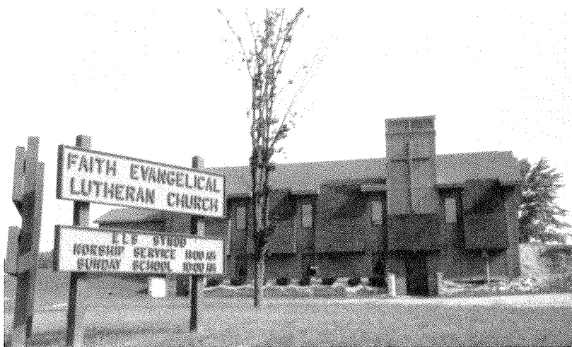
FAITH (Hillman, Michigan)