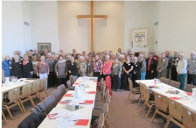
Women's Mission Rally, October 17, 2015, at Abiding Shepherd Lutheran, Cottage Grove, Wisconsin