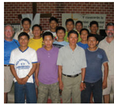
Gospel workers in the Amazon region of Peru gather for study at the Lutheran Bible Institute of the Amazon Jungle.

has come through what is known as the Mission Advancement Project (MAP, Inc.), a primary funding source for Thoughts of Faith, Inc. Lately we have been informed that the gifts coming annually from MAP will be severely curtailed. Please pray for the mission work going on in all of the countries and remember the need. We trust that God will continue to provide resources and workers in his harvest field.